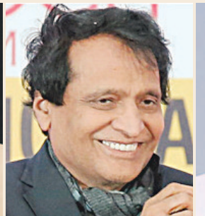
BEYOND BUSINESS RANKINGS Suresh Prabhu MP & G20 Sherpa